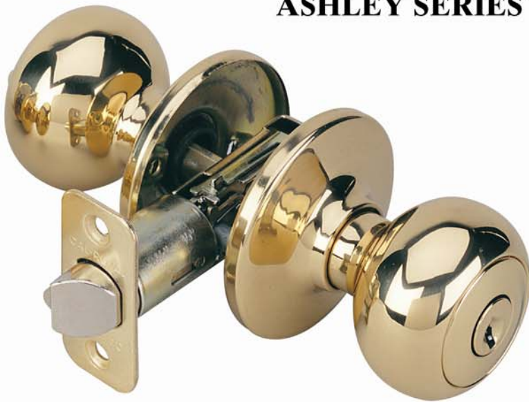
HAR-00 US3 ENTRY