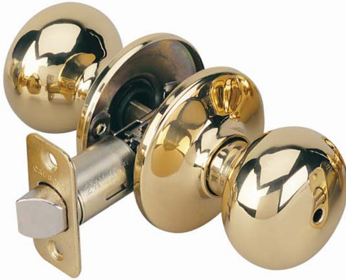
HAR-20 US3 PRIVACY