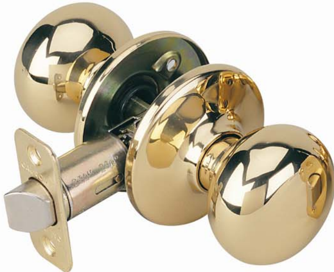
HAR-30 US3 PASSAGE