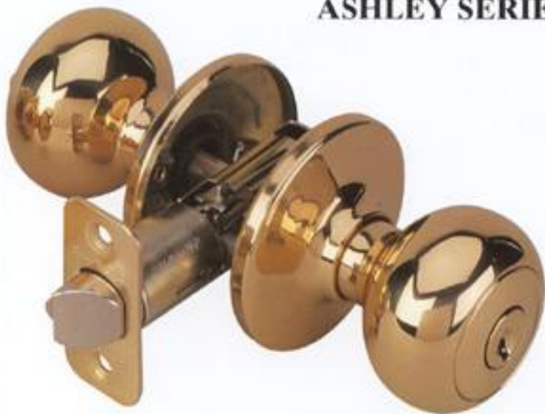
HAR-00 US3 ENTRY