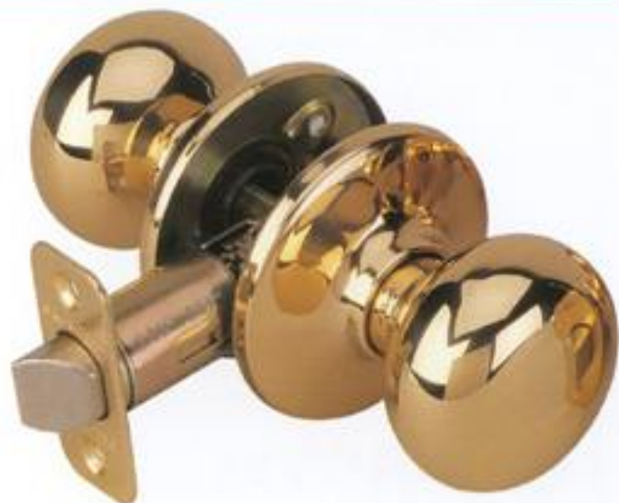
HAR-00 US3 ENTRY