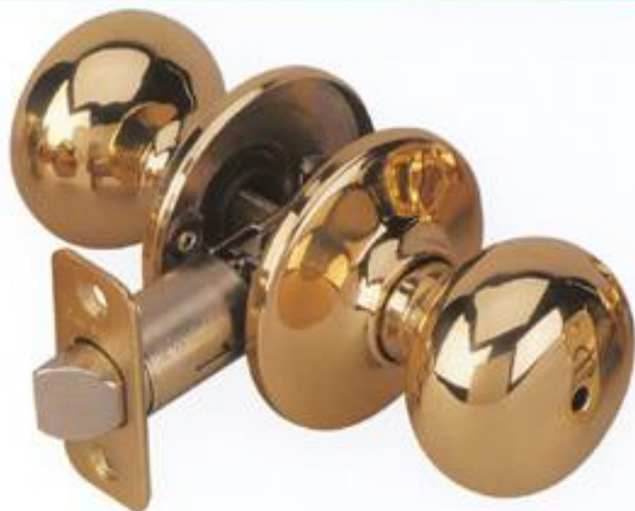
HAR-00 US3 ENTRY