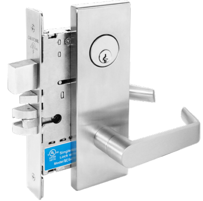
Complete Electrified Mortise Lock with SE Trim

REFER TO PRICELIST FOR STOCK FINISHES AND FUNCTIONS