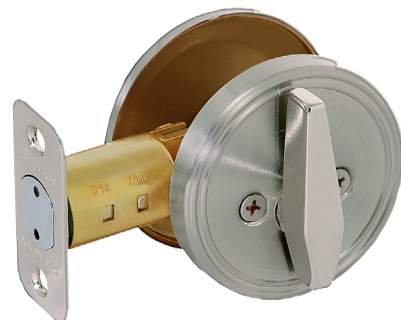
ID-801 ONE SIDED BOLT WITH COVER