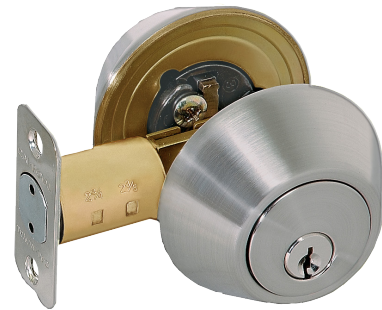
EDD-400 DOUBLE CYLINDER DEADBOLT