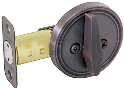
ID-701 ONE SIDED BOLT