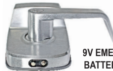
9V EMERGENCY BATTERY PORT