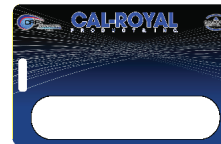
PROXIMITY RFID CARD