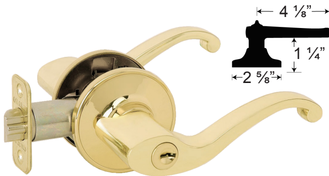
LEPRE00 (HANCED) SPECIFY PREMIER SERIES