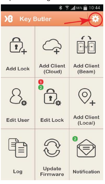
TAP User Manual option